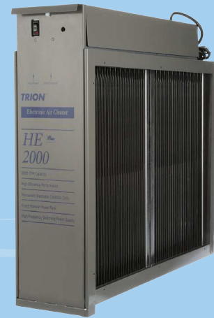
HE Plus 1400 HE Plus 2000

Available in two sizes and capable of cleaning 1,400 to 2,000 cubic feet per minute (CFM), TRION® air cleaners feature a standard, built-in airflow sensor so that the air cleaner is only running when the heating or air conditioning equipment is running to reduce energy consumption.