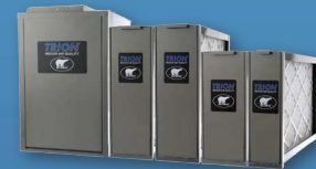
Media Air Cleaners