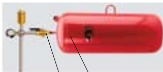
Horizontal Tank Installation with Rolairtrol Air Separator

These valves are not recommended to be used on potable water tanks.