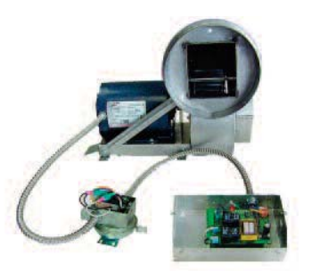
HS3, HS4 & HS5

This table is for general reference only. Refer to complete selection table in Side Wall Power Venter Reference Guide for sizing details.