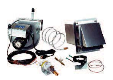
VP-2F & VP-3F