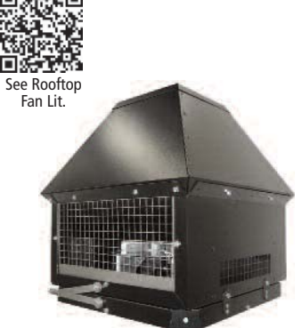
RT750 & RT1500

Use to increase draft for gas & oil fired heaters or to maintain velocity in exhaust chases and clothes dryer vents serving multiple floors/sources. Pair with COP2 Control for automatic pressure based speed control, ramping fan up and down based on the volume of exhaust entering the chase or common vent. Clamshell design simplifies installation, inspection and service. Material handling stainless steel impeller repels soot and lint. Includes PSA-1 Fan Proving switch. Black high temp powder coat finish.