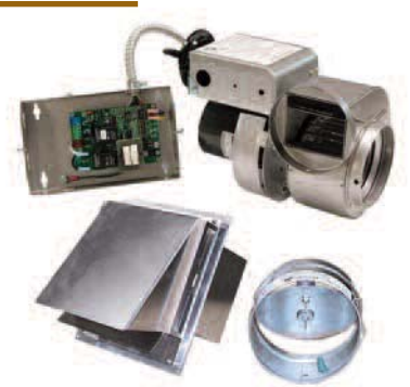
GPAKJ & GPAK1