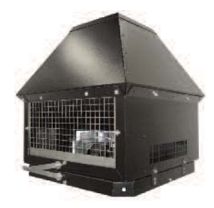
RT750H & RT1500H

Install included speed control adjacent to hearth area for easy draft control.