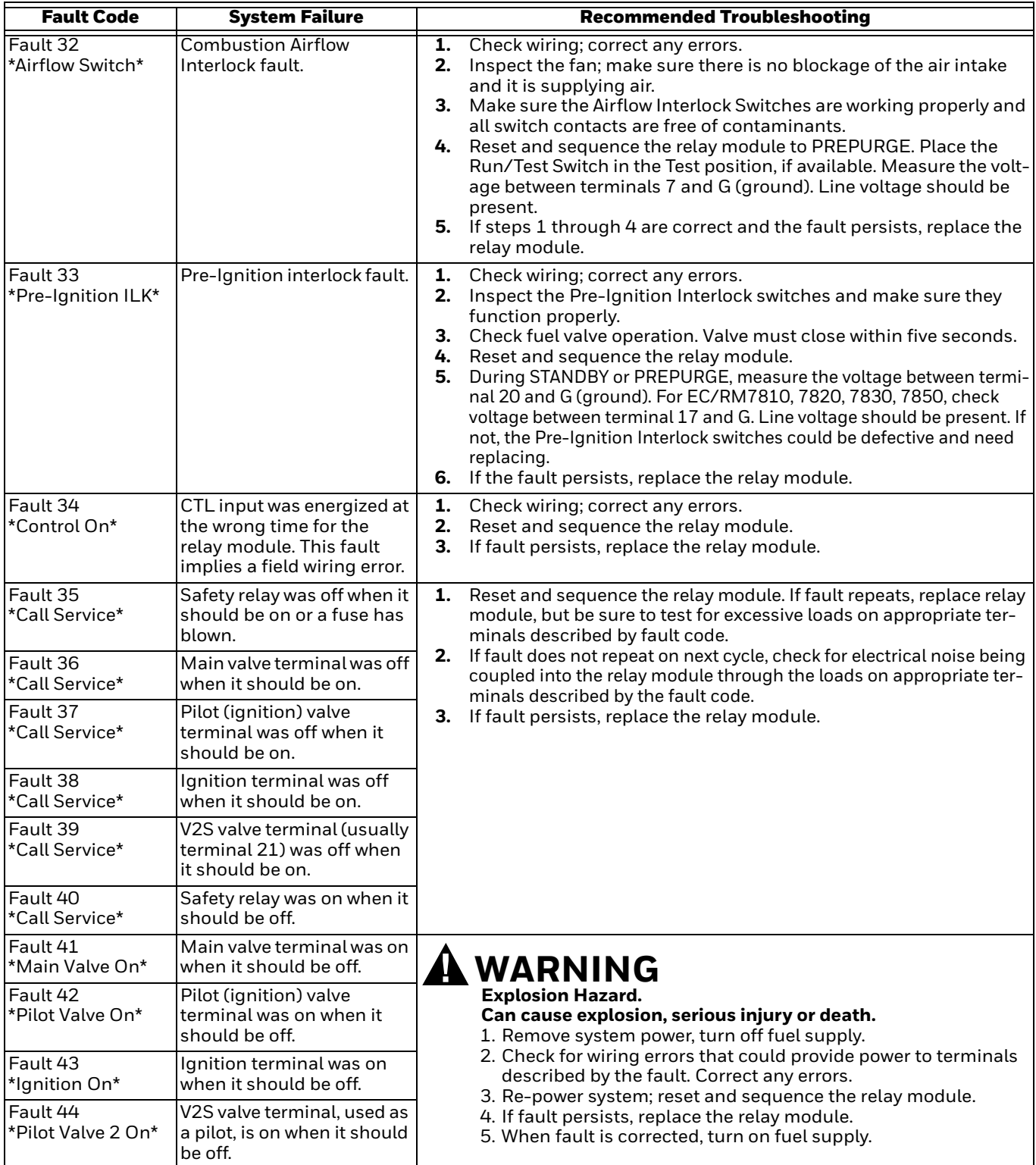
Table 3. Hold and Fault Message Summary. (Continued)