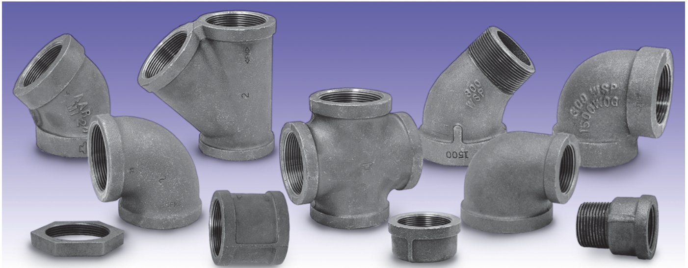
Malleable Iron Threaded Pipe Unions Pressure - Temperature Ratings