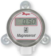
Standard MS with optional LCD