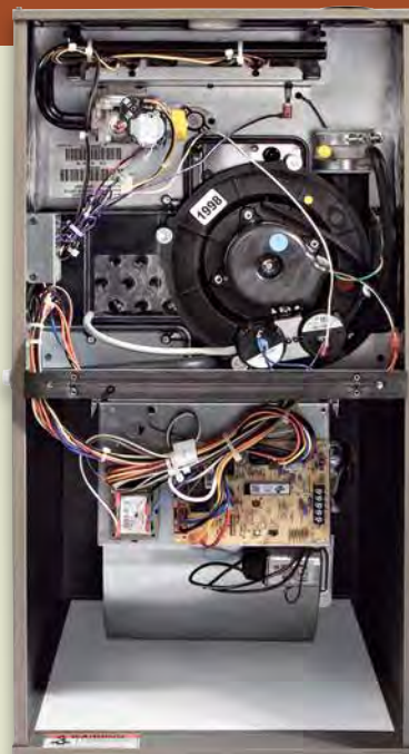
95.5% AFUE model shown

Electronic hot surface ignition saves fuel costs with increased dependability and reliability