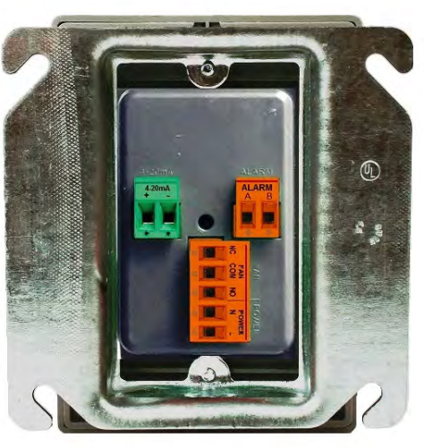
12-Series Rear View

Made in the U.S.A. with US and imported materials © Aerionics 2015. All rights reserved. Macurco is a trademark of Aerionics, Inc.