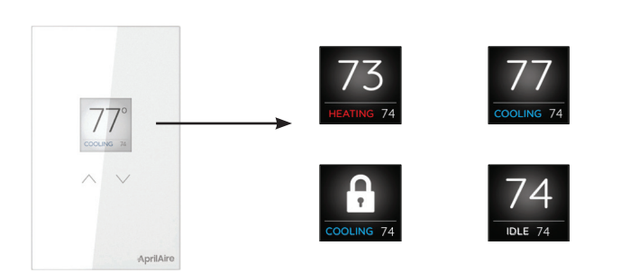
Individual zone screens